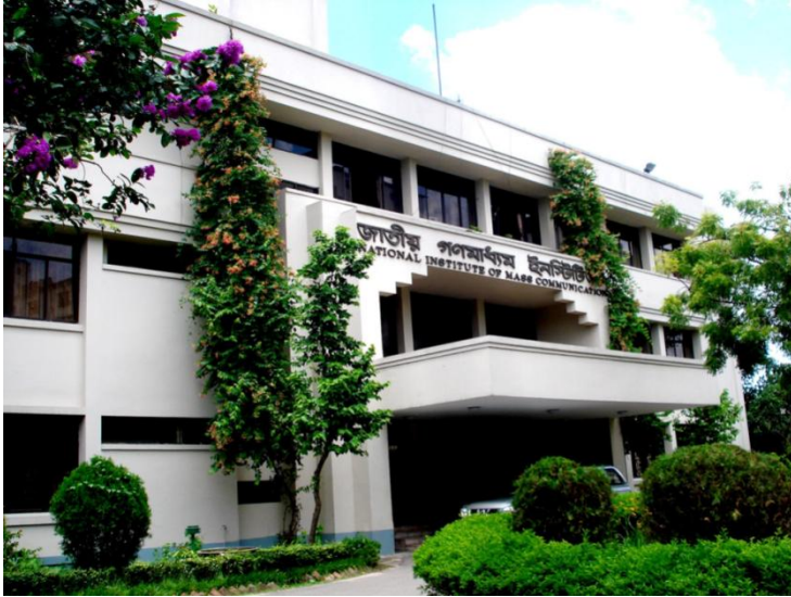
Picture: Campus of Dhaka School of Broadcast Journalism